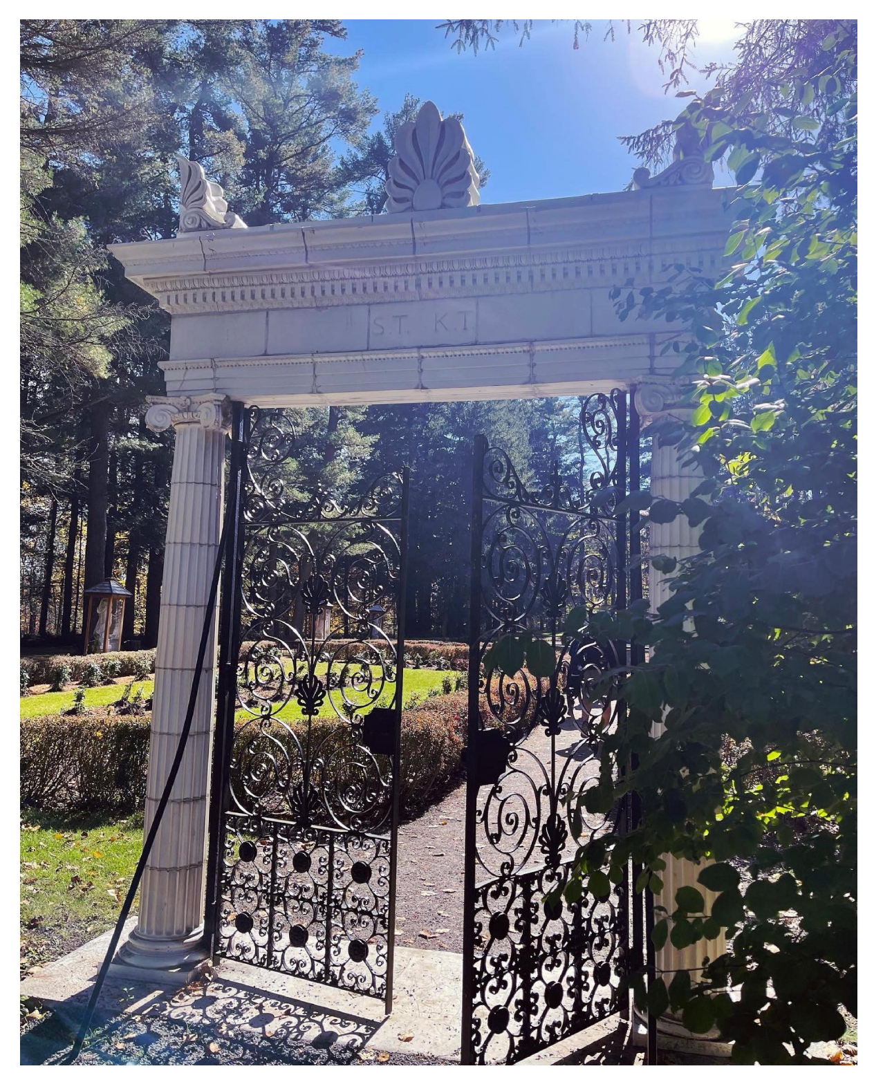
Figure 2 : Formal entrance to the Rose Garden at Yaddo. The entrance includes a pair of Greek revival columns over an ornate iron gate.